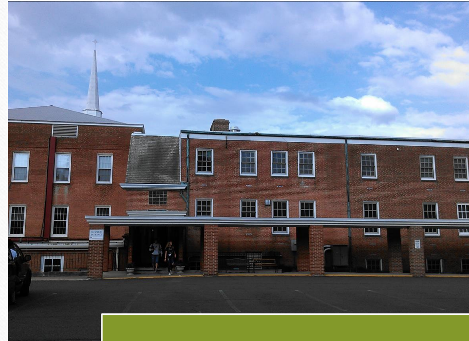
Church that housed us