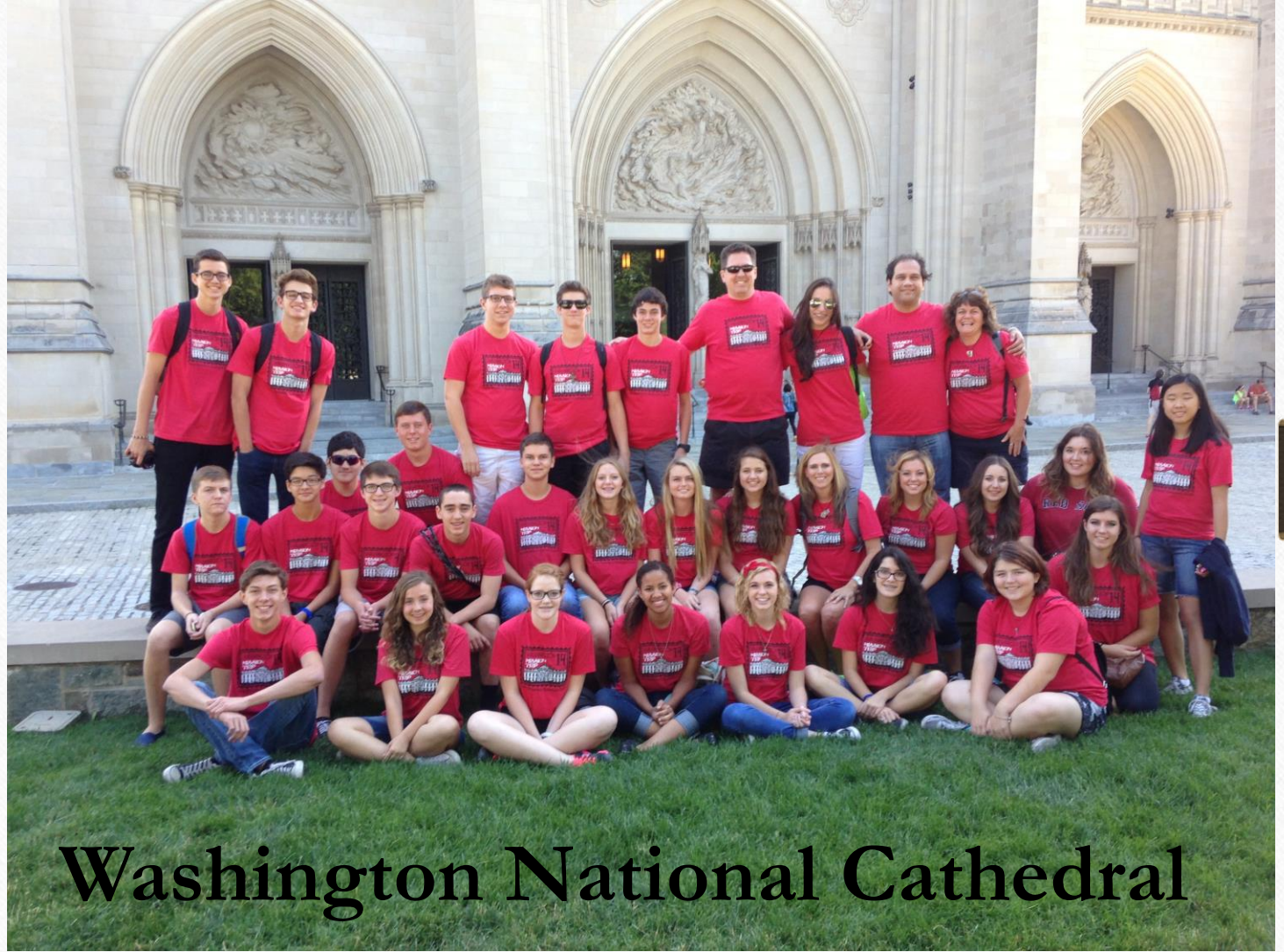
Washington National Cathedral